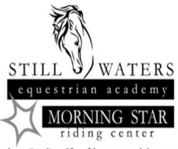
Sharing God's gift of horses with anyone regardless of AGE, INCOME or ABILITY

While the member handbook is an invaluable resource for our members, there are some challenges with having a