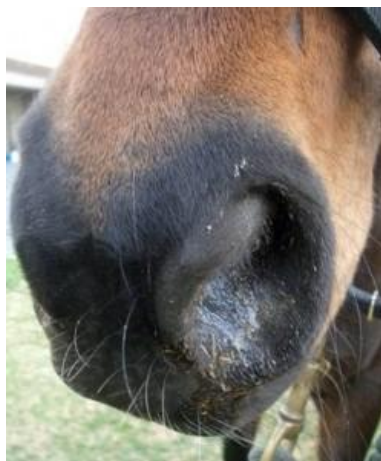
A horse with nasal discharge due to EHV-1.

For more information about EHV-1, please contact your local veterinarian.