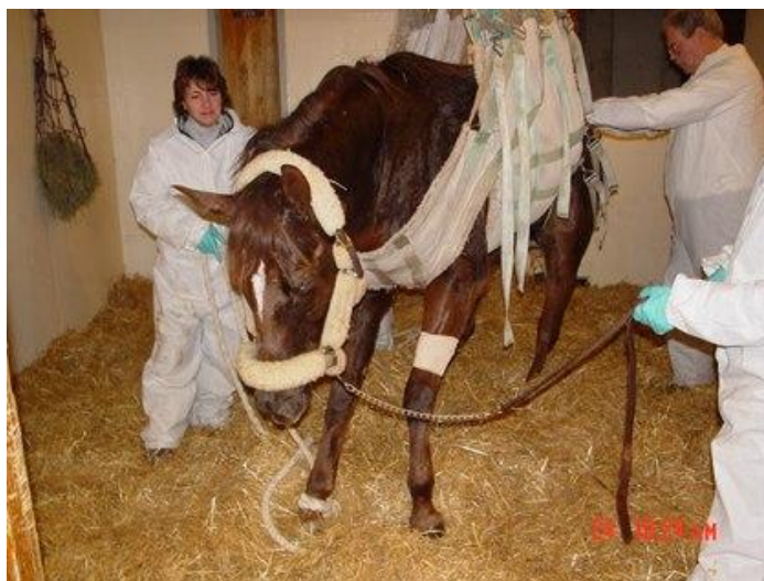
A horse with neurologic EHV-1, recovering in a sling.