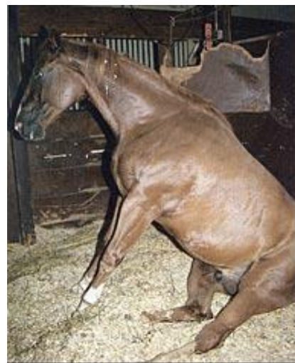
A horse with neurologic EHV-1 that is 'dog-sitting'.