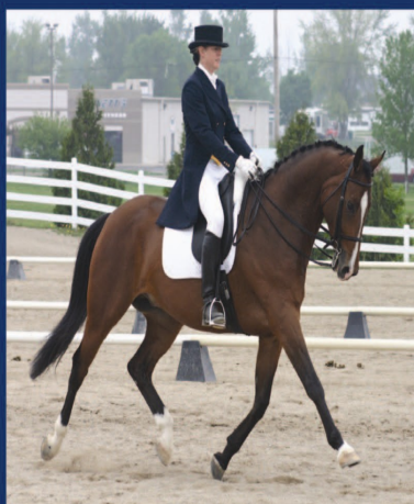
Ventura, started in 2002 by La Riata Ranch Champion FEI 5-year-old 2004 WBFSH Selection Trials, Competed YH Championships 2004