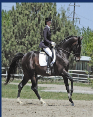
Der Graf, RPSI Stallion Donnerhall x Pik König Trained by LRR and standing at La Riata Ranch