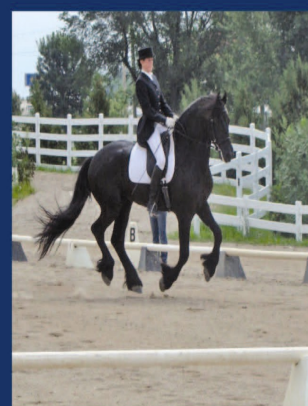
Maraus, 5-year-old Friesian stallion. Trained by La Riata Ranch. Training level champion at his first show out.

Call us at 712-778-5295 (Barn) or 402-598-7475 (Cell) or Visit us at www.lariataranch.com