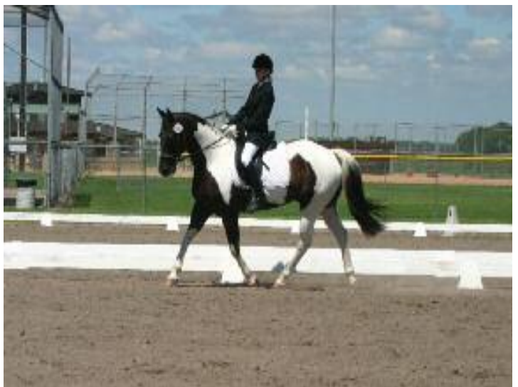
Snapshots from the 2009 NDA Schooling Show Championships Clockwise from Upper Left: