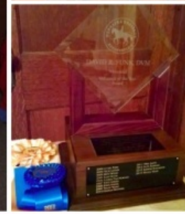
“Totally 80’s” Annual Meeting/Awards Banquet