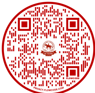
May 19th, Cornhusker Schooling Show Sign-up

Are you looking to fill your volunteer hours? NDA has different options for you coming up. May 19th, the Classic Schooling show and May 25-26 the Cornhusker Classic I & II. Just scan the QR code below to sign up to volunteer!