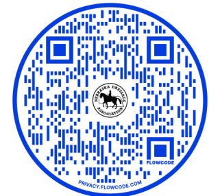
May 25-26, Cornhusker Classic I & II Show Sign-up