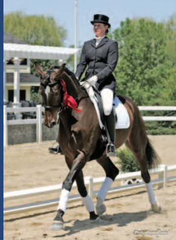
Bijoux, started fall of 2007 by La Riata Ranch.

Reserve Champion FEI 6-year-old WBFSH Selection Trials. Selected for Young Horse Championship 2009.