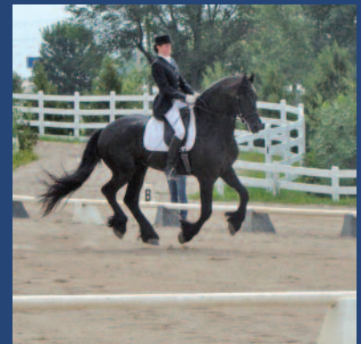
Maraus, 5-year-old Friesian stallion. Trained by La Riata Ranch. Training level champion at his first show out.

Call us at 712-778-5295 (Barn) or 402-598-7475 (Cell) or Visit us at www.lariataranch.com