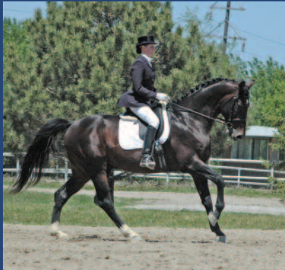
Der Graf, RPSI Stallion Donnerhall x Pik König Trained by LRR and standing at La Riata Ranch