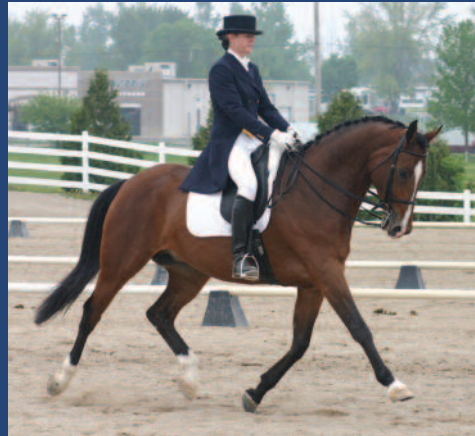
Ventura, started in 2002 by La Riata Ranch Champion FEI 5-year-old 2004 WBFSH Selection Trials, Competed YH Championships 2004