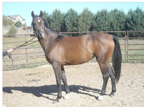
Lakota Moon 2010